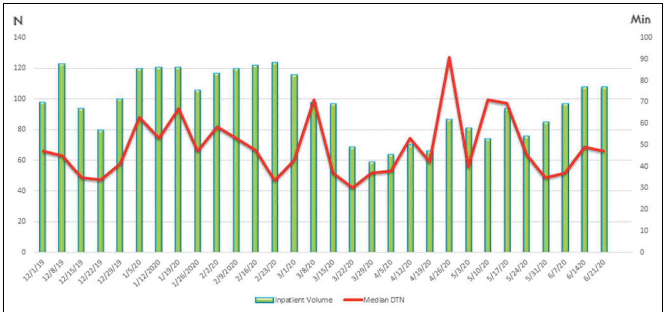
Fig. 2. Inpatient acute stroke consult volume per week and median CTN times per week. Weekly volumes of acute stroke consults seen inpatient in 171 hospitals in 19 states, and the average CTN time in minutes for that week of the consults who received thrombolytics. CTN, call to needle.

for maintained acute stroke treatment with thrombolytics during the COVID-19 pandemic. While the COVID-19 pandemic led to a significant decline in stroke presentations globally, there was no significant difference in the percentage of consults who received thrombolytics in our cohort. The decline in consult volume of 27% was consistent with reports from other publications. 4-6 With no change in treatment percentage and presenting NIHSS scores, there is no indication that patients with more mild symptoms were staying home, while those with more severe symptoms presenting as has been speculated.